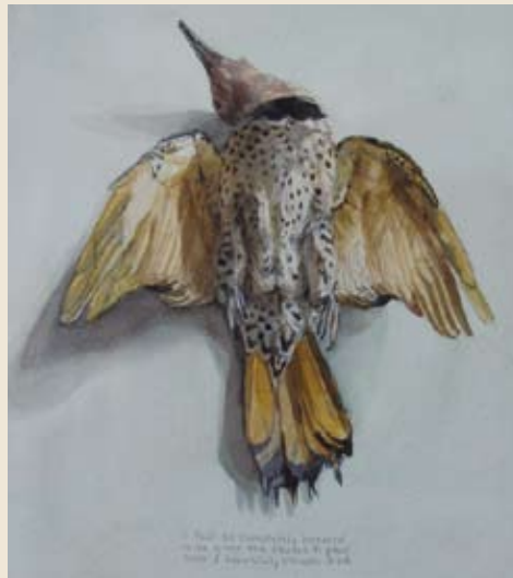
Work by Katie Musolff

View student work from the class Learn to Draw what you See . While learning about portraiture and facial proportions, students took turns drawing one another and created a beautiful series of portraiture!