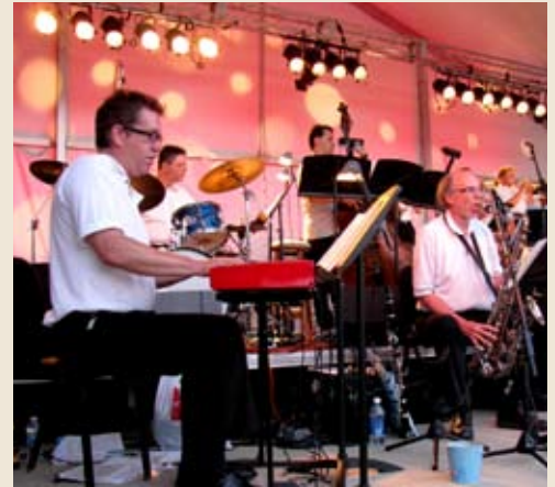
Wilson Center Big Band