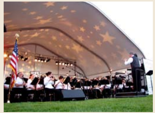
Cream City Concert Band

Sponsored by UBS Financial Services, Inc.