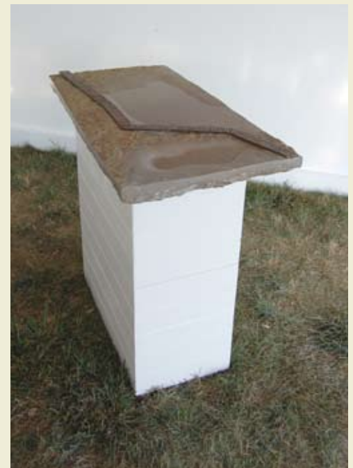
Wet Land by Emily Belknap, (mixed media installation).