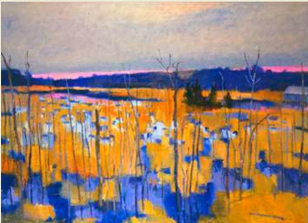
Wetland , detail by Rodger Bechtold (oil; 50" x 70"). 2001