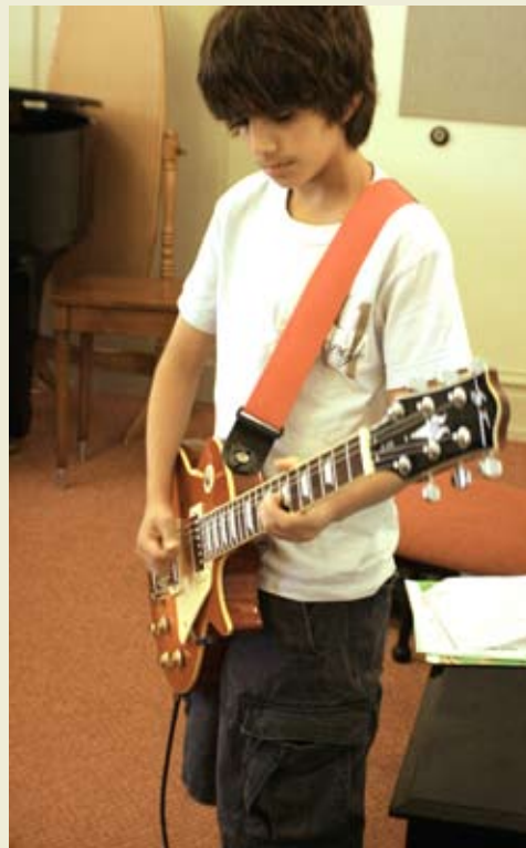
The Wisconsin Conservatory of Music offers many music classes at the Wilson Center for all ages.

A quick look at just some of the classes offered this fall in art, theater, dance, and music: