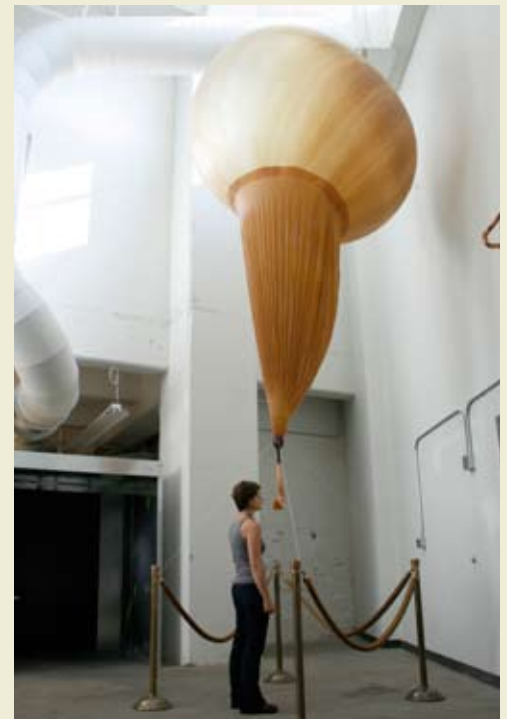
Balloon Mouth Pieces 11 by Yevgeniya Kaganovich (cast rubber, weather balloon, helium, plastic, cord, stanchions; 22' x 8' x 8').