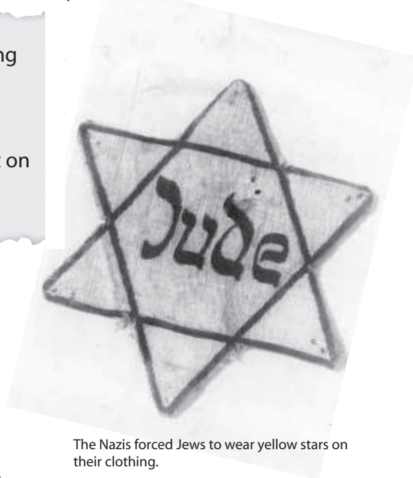
The Nazis forced Jews to wear yellow stars on their clothing.

In the late 1930s and early 1940s, the Nazis made it mandatory for all Jewish people to wear a yellow Star of David with the word “Jew” on the left chest of outer clothing. This visual labeling clearly distinguished Jews from non-Jews. The “Jewish Badge” made it easier for those in power to discriminate against and persecute Jews.