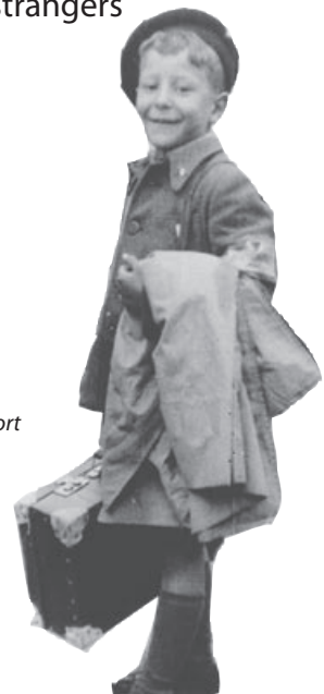
A boy of the Kindertransport departs for freedom.