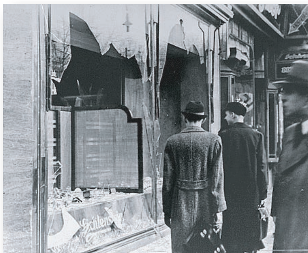
Passersby examine the damage done to a Jewish owned store by the Nazis during Kristallnacht .

In German, Kristall translates to "crystal," meaning broken glass, and Nacht means "night." Because of the huge amount of shattered store windowpanes that covered German streets, these violent attacks came to be called Kristallnacht —"Night of Broken Glass."