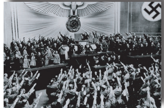
Politicians salute dictator Adolf Hitler - "Sieg Heil!"