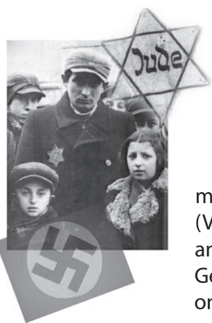
Visual images and symbols are used in the stage production of My Heart in a Suitcase

To present historically accurate visual images, this production incorporates symbols and gestures that are now considered universally offensive: the Nazi swastika and uniform, the "Heil, Hitler" salute, and the six-pointed yellow Star of David inscribed with the word "Jew."