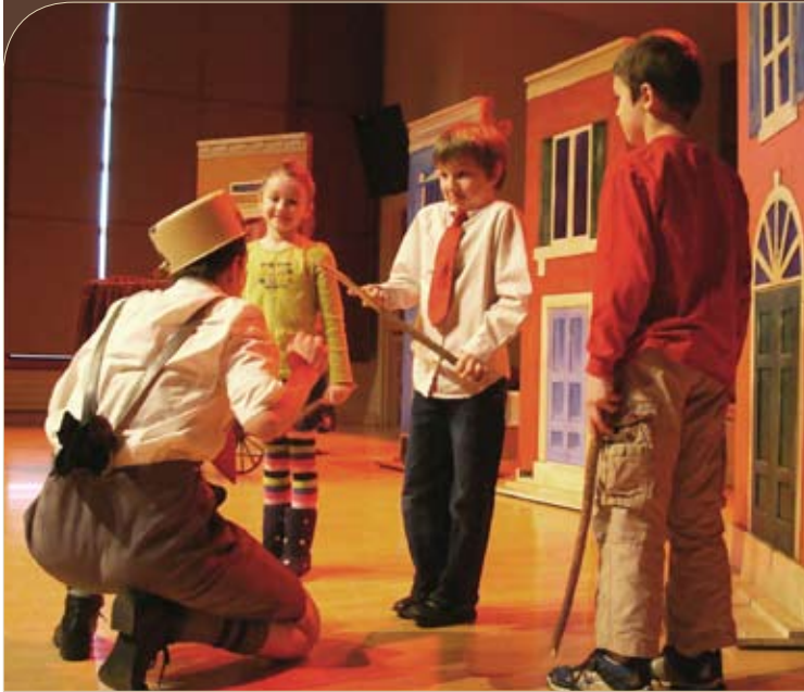
A Wilson Center Beyond the Classroom performance of Pinocchio performed by the Florentine Opera in the Dawes Studio Theater in January 2009.