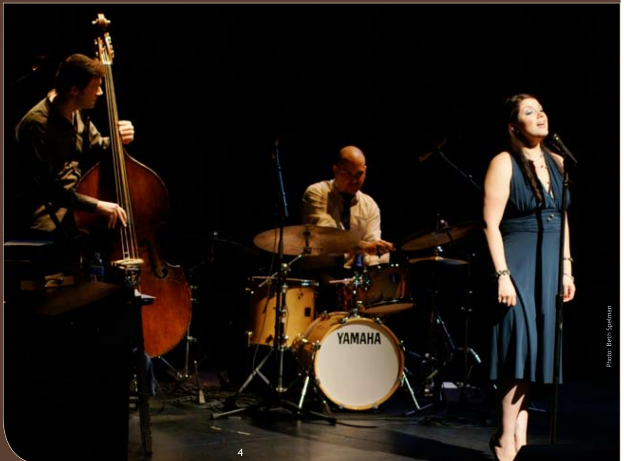
Jazz-starlet Jane Monheit performed amazingly in the Kuttemperoor Auditorium in October 2009.

But it was a little rock n' roll, R&B, and Motown that closed the season: Vonda Shepard, of Ally McBeal fame, and the age-less Temptations brought a party all on their own with performances that got the walls shaking!