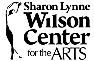
TABLE SPONSORSHIP OPPORTUNITIES