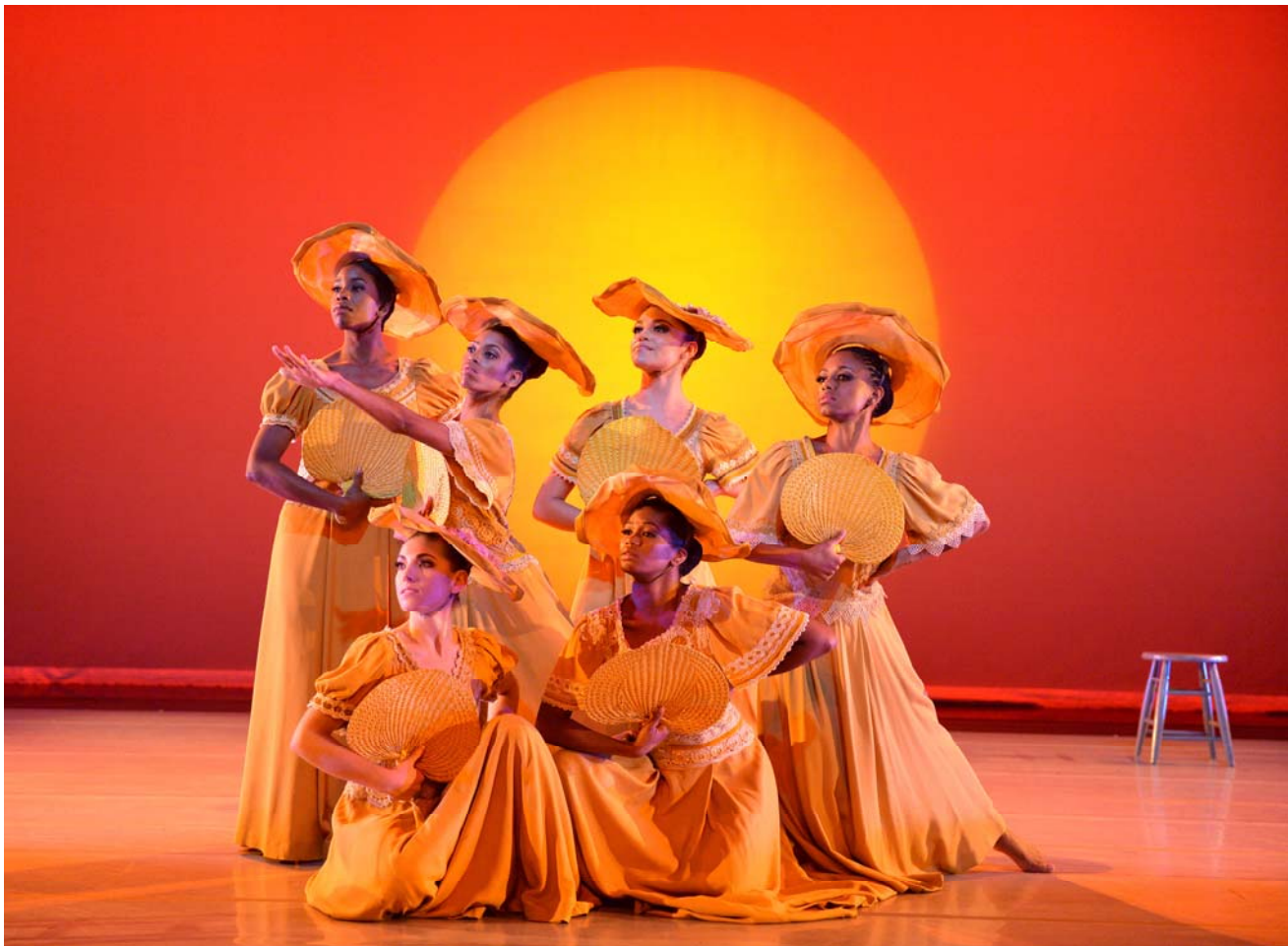
Ailey II in Alvin Ailey's Revelations.

The lighting designer creates the design using lights, color and special effects. Most dances use many lights at once to create the mood on stage. This designer also works very closely with the choreographer and all the other designers to create an atmosphere that enhances the dance. The lighting designer has to ensure that his/her ideas will coincide with the choreographer's vision. Once the idea is developed, it has to be put into a written format: the lighting plot . This plot informs the lighting technicians where the lights should be hung and how they are wired.